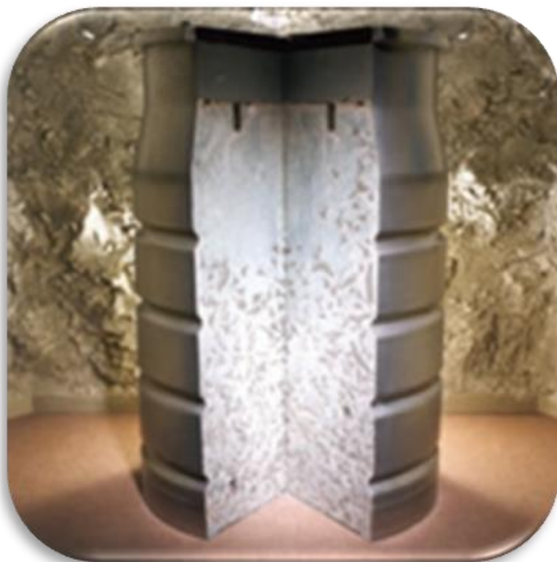
Cross section of a drum containing intermediate-level waste

Even if one of these concrete drums should fall off the truck and break open, the radioactive materials inside will never be exposed as it is sealed inside the concrete.