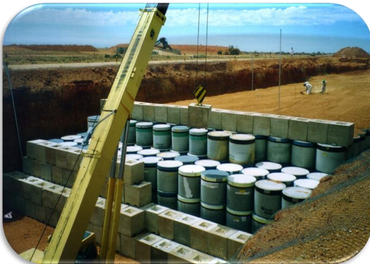
Concrete drums are covered with layers of clay and top soil.