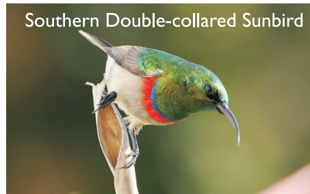
Southern Double-collared Sunbird

A full bird list is available from the Visitors Centre or Environmental and Land Management Office