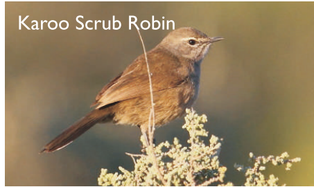
Karoo Scrub Robin

More than 172 bird species have been identified in the Nature Reserve.