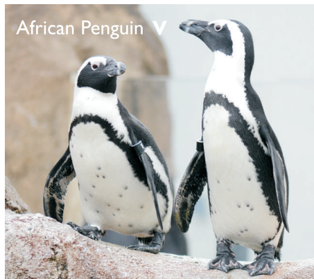
African Penguin V