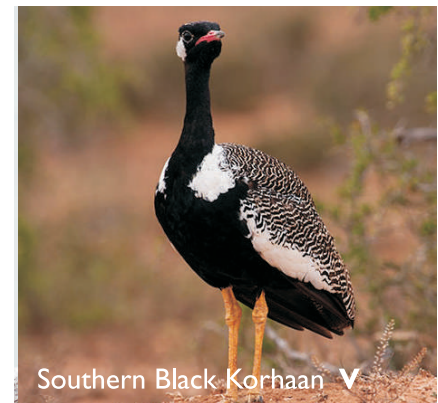
Southern Black Korhaan V