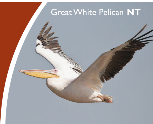
Great White Pelican NT