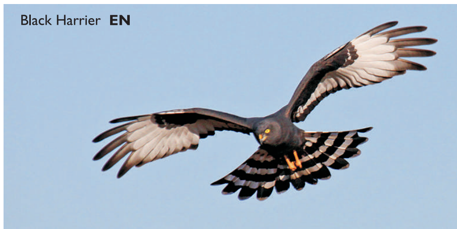
Black Harrier EN

Conservation status: NT - Near threatened V -Vulnerable EN - Endangered