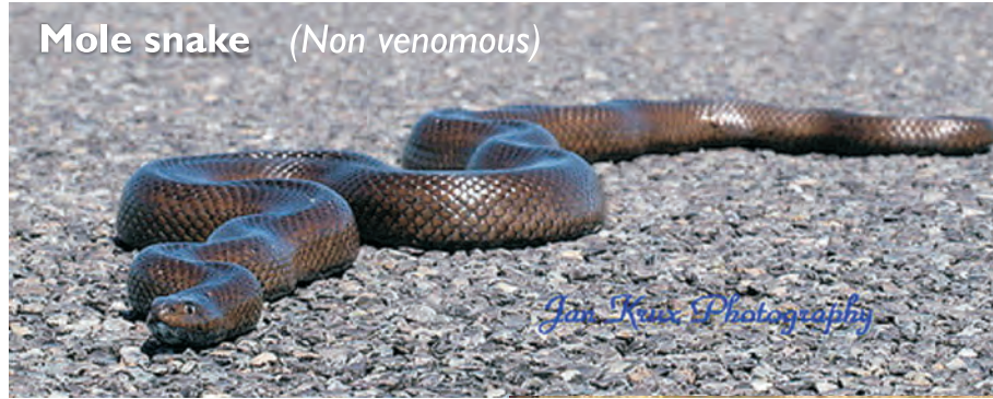
Mole snake (Non venomous)