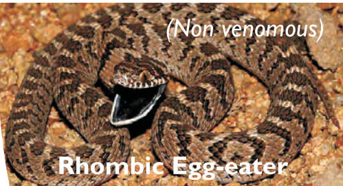
Rhombic Egg-eater (Non venomous)

Most snakes species found at Koeberg are not dangerous