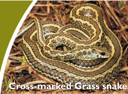
Cross-marked Grass snake