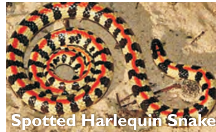
Spotted Harlequin Snake

Most snakes species found at Koeberg are not dangerous