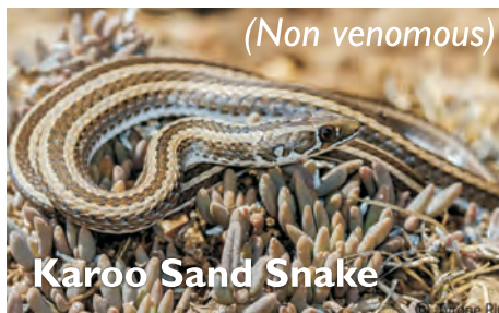
Karoo Sand Snake (Non venomous)