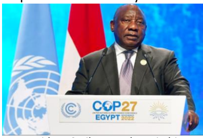
President Cyril Ramaphosa in his address at COP27

President Cyril Ramaphosa in his address at COP27, said that the International Partners Group of five nations has already given South Africa's Just Energy Transition investment plan the go-ahead at the climate talks. They plan to make an additional R10 billion available to South Africa on top of the already agreed upon R140 billion for the first phase of the programme.