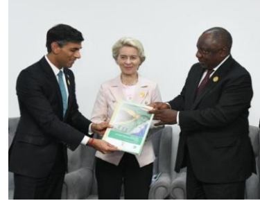
President Cyril Ramaphosa and UK prime minister Rishi Sunak (far left) and Ursula von der Leyen, President of the EU Commission

This funding package will be disbursed through various mechanisms over the five-year period including grants, concessional loans and investments and risk sharing instruments. South Africa is looking to move away from coal-fired power stations to renewable energy to reduce the severity of climate change. Ramaphosa called upon developed countries to honour their commitments made at COP26 "because failing to honour these commitments breaks trust and confidence in the process." The President also mentioned that international funding institutions need to transform from plans to move forward: "At present, multilateral support is out of reach of the majority of the world's population due to landing policies that are risk-averse and carry onerous costs."