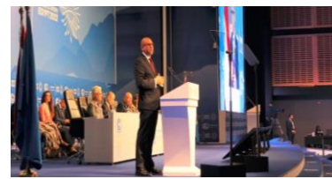
Simon Stiell, the UN climate chief, speaks at the opening of COP27

The UN Climate Change Conference (COP27) in Sharm el-Sheikh - Egypt, is intended to shift the world towards the implementation of the previously agreed plans to tackle humanity's greatest challenge. Simon Stiell, the new Executive Secretary of the UN Framework Convention on Climate Change (UNFCCC), said at the opening of COP27 "Today a new era begins – and we begin to do things differently. Paris gave us the agreement. Katowice and Glasgow gave us the plan. Sharm el-Sheikh shifts us to implementation. No one can be a mere passenger on this journey. This is the signal that times have changed." Climate action is an ongoing process, not an event, and it requires extraordinary collaboration between countries, governments and businesses.