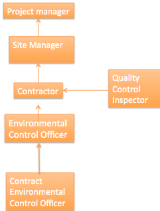
Figure 1: Reporting structure