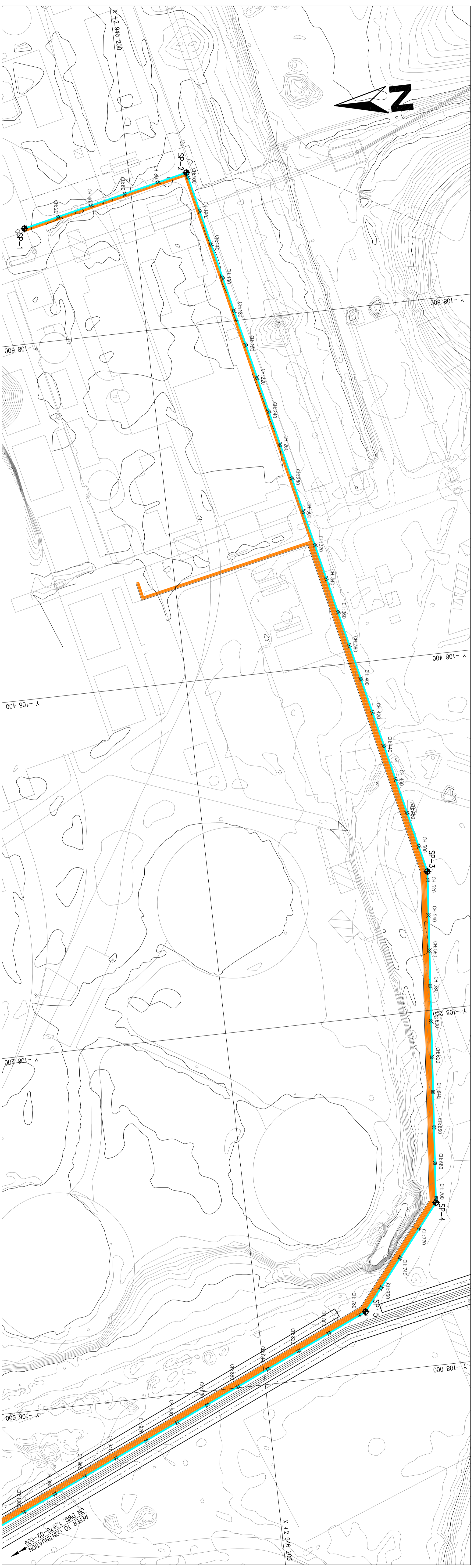
LAYOUT OF SLURRY PIPELINE 1:1000