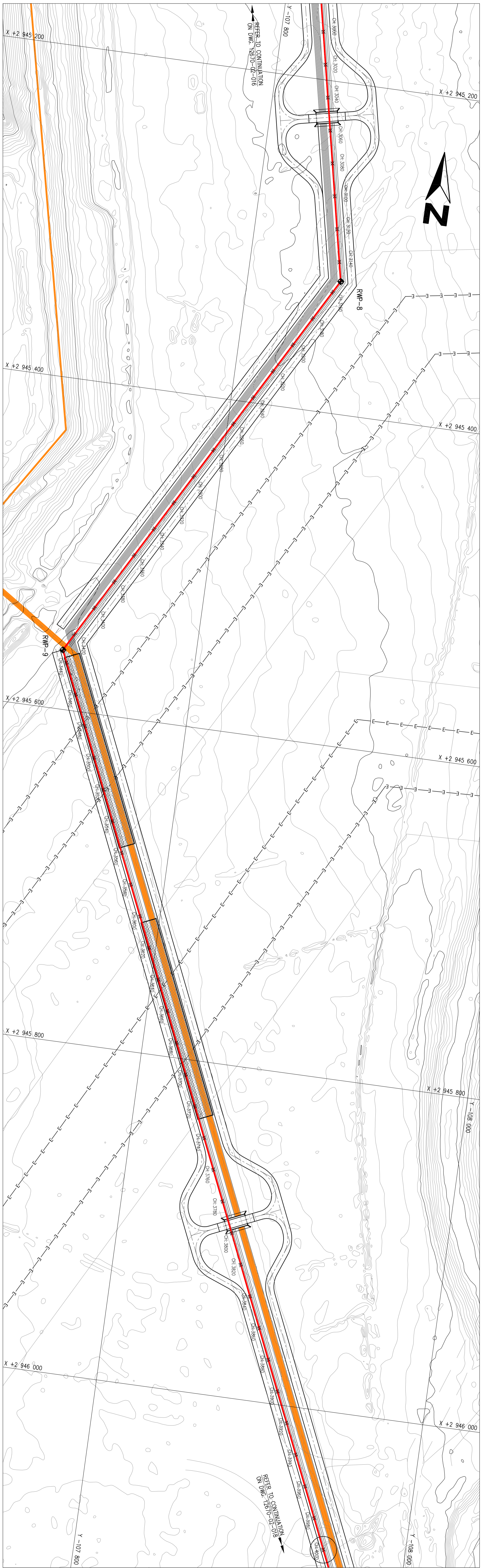
LAYOUT OF RETURN WATER PIPELINE 1:1000