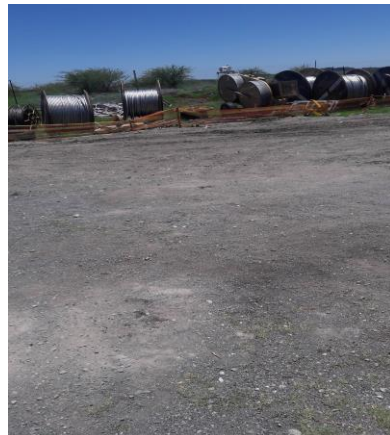
Contaminated soil stored in a bucket and storage area at camp