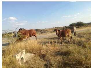
Photo7: Animals to be taken care