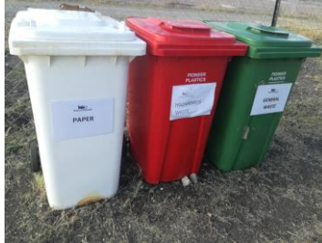
Photo 2,3,4 containing mixed wastes of food plastic waste etc