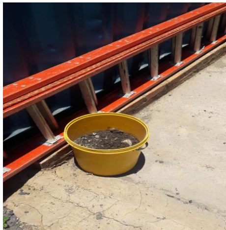
Photo 3 ontaminated soil stored in a bucket at camp