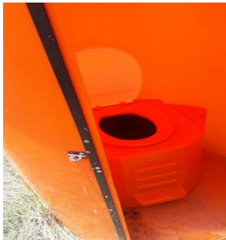
Photo 3 toilet serviced