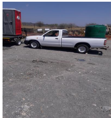
Photo 5& 6: smoking area moved far from diesel tank ad trailer and toilet at site camp