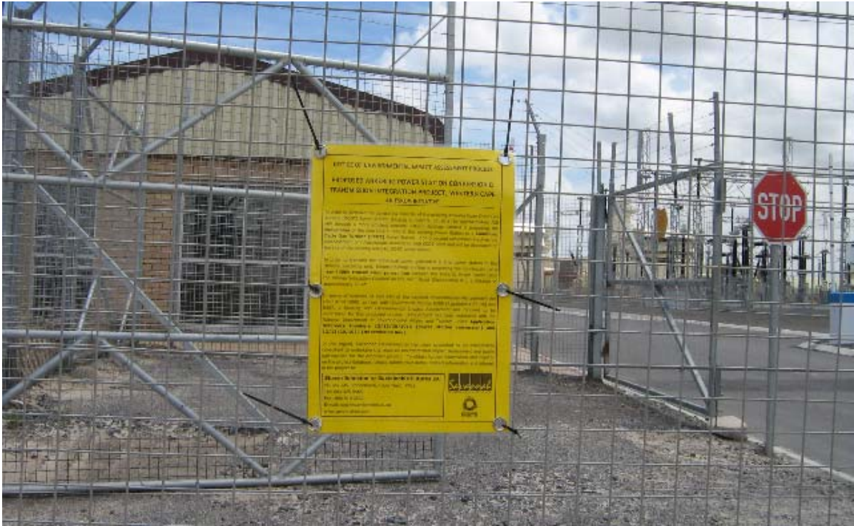
Site notice placed on the fence of the Ankerlig Power Station