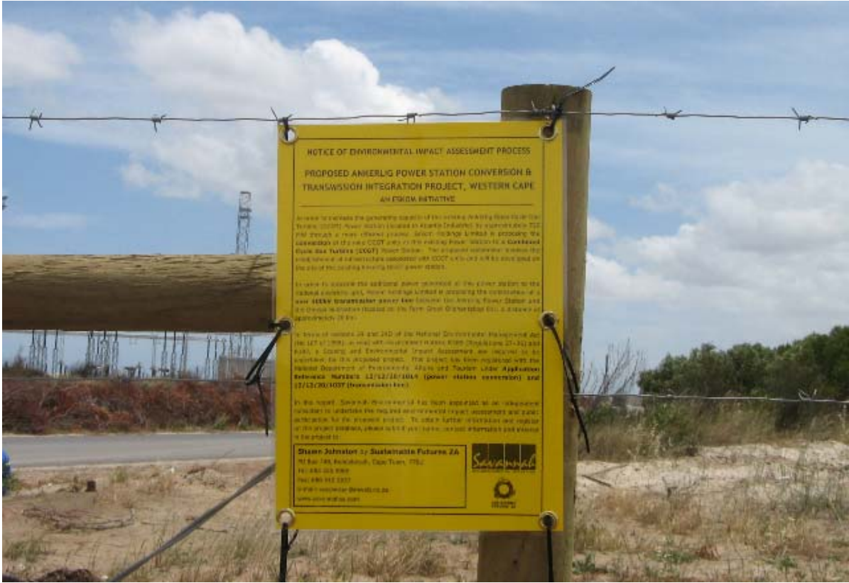
Site notice placed on the fence of the Ankerlig Power Station expansion site