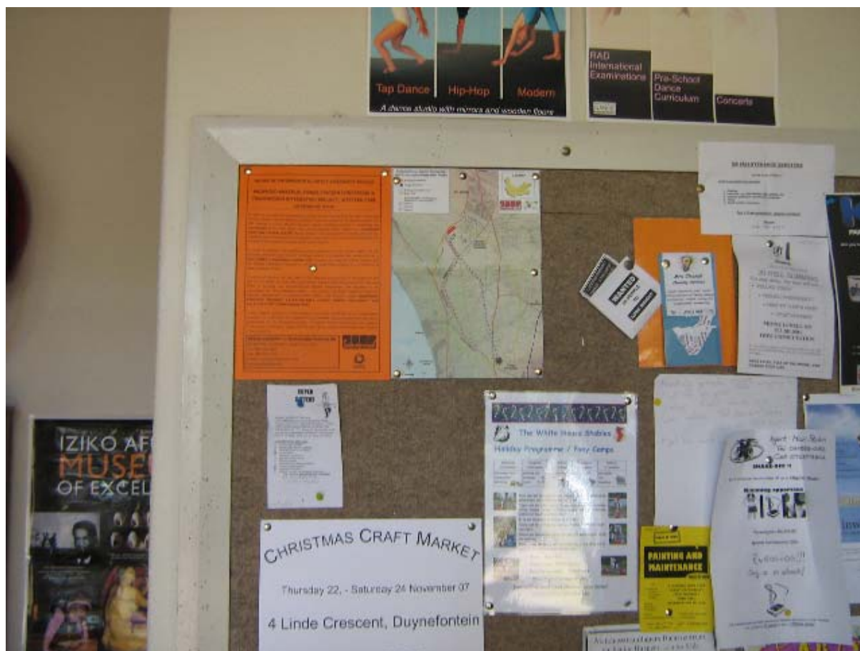
Site notice placed on notice board in community centre within Atlantis