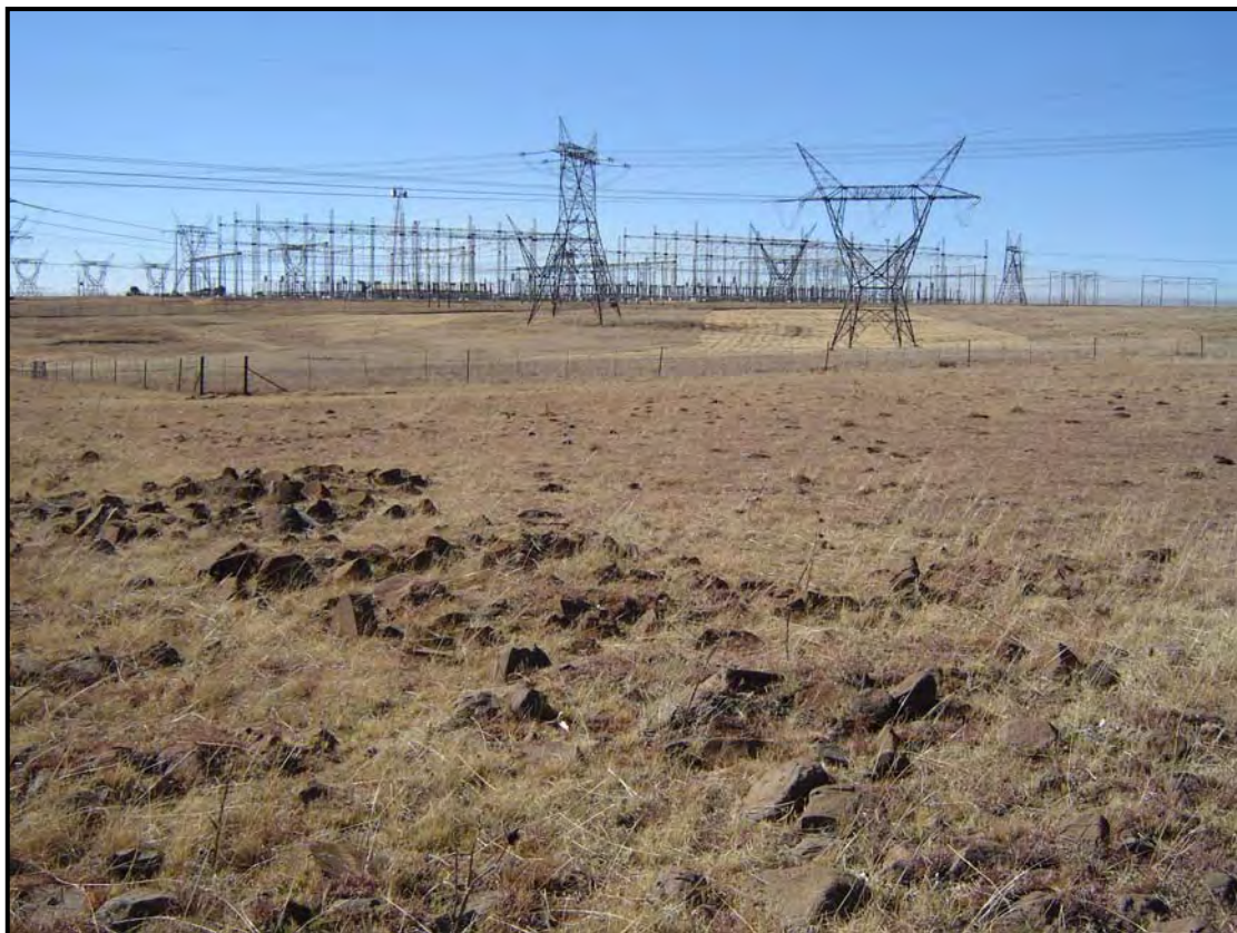
Photo 15: View of northern section of graveyard – photograph taken in a NE direction