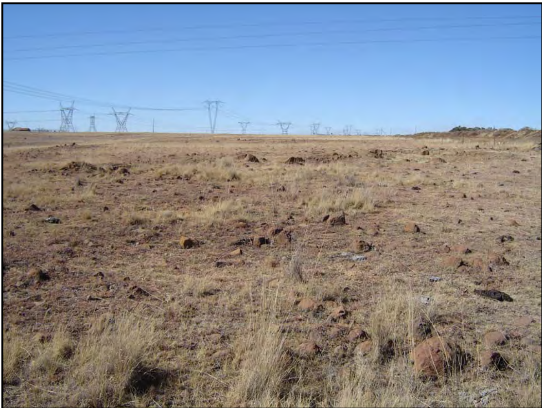
Photo 4: Natural distribution of rocks in southern section of surveyed area