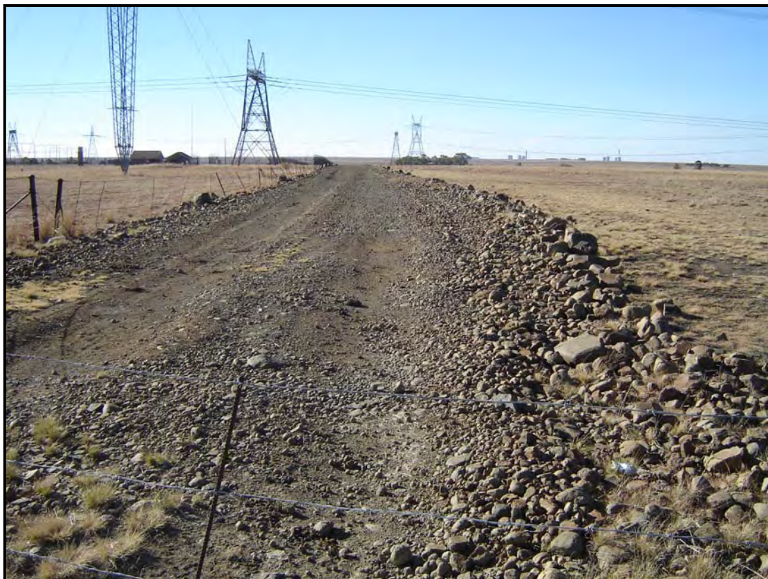
Photo 9: New road running north-south to the east of current substation and surveyed area - photo taken in a northerly direction