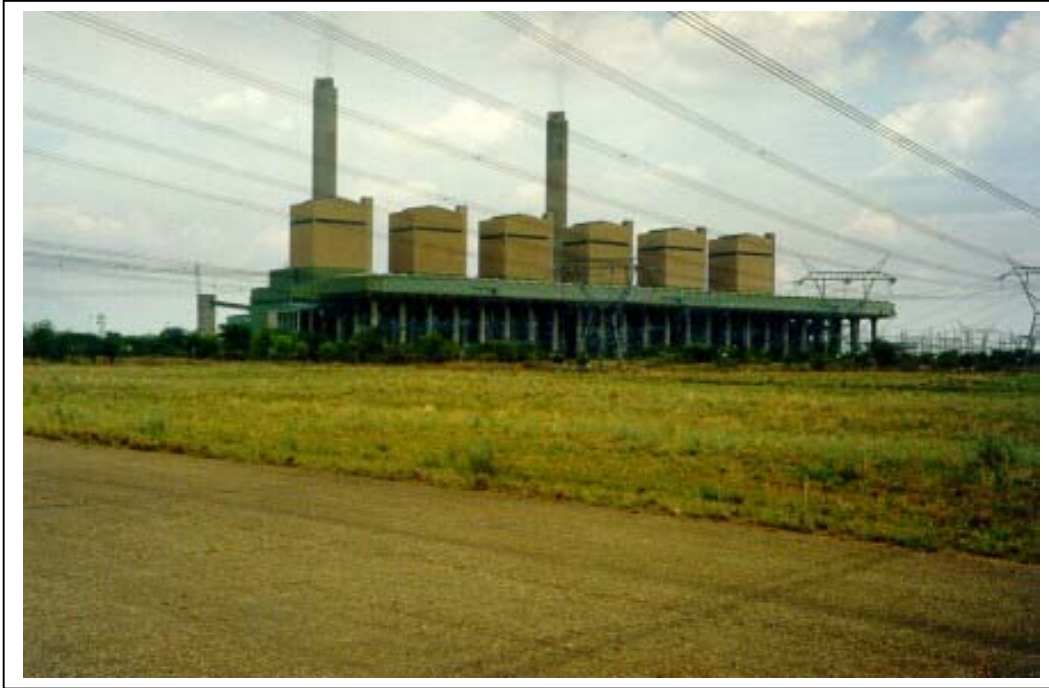
Photograph 7: Matimba Power Station, near Lephalale, with numerous overhead powerlines feeding out of the Matimba Substation