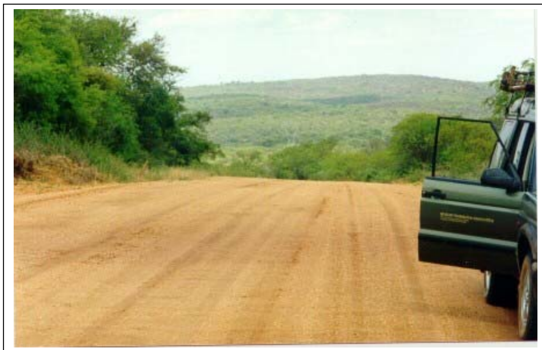
Photograph 2: Towers of the existing 400 kV Transmission line in the distance is camouflaged by a mottled backdrop, and are not readily visible from the road between Moepel Farms and the Masebe Nature Reserve