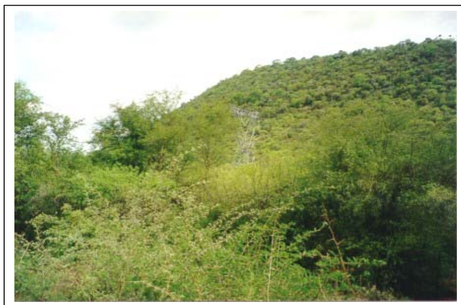
Photograph 1: Tower of the existing 400 kV Transmission line against a mottled, vegetation backdrop near Moepel Farms

Corridors 2, 3 and 4 will have a high to very high impact along the eastern and northern boundaries of this reserve. In addition, due to the presence of the existing 400 kV Transmission line on the southern side of the reserve, the construction of the proposed new Transmission line within corridors 2, 3 or 4 would result in the reserve being visually impacted on to the south, east and north, and effectively being surrounded, or “boxed-in” by Transmission line developments.