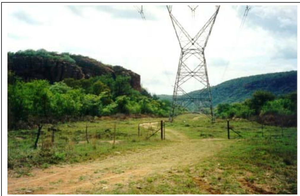
Photograph 6: Existing 400 kV Transmission line passes through the nek between Moepel Farms and Masebe Nature Reserve