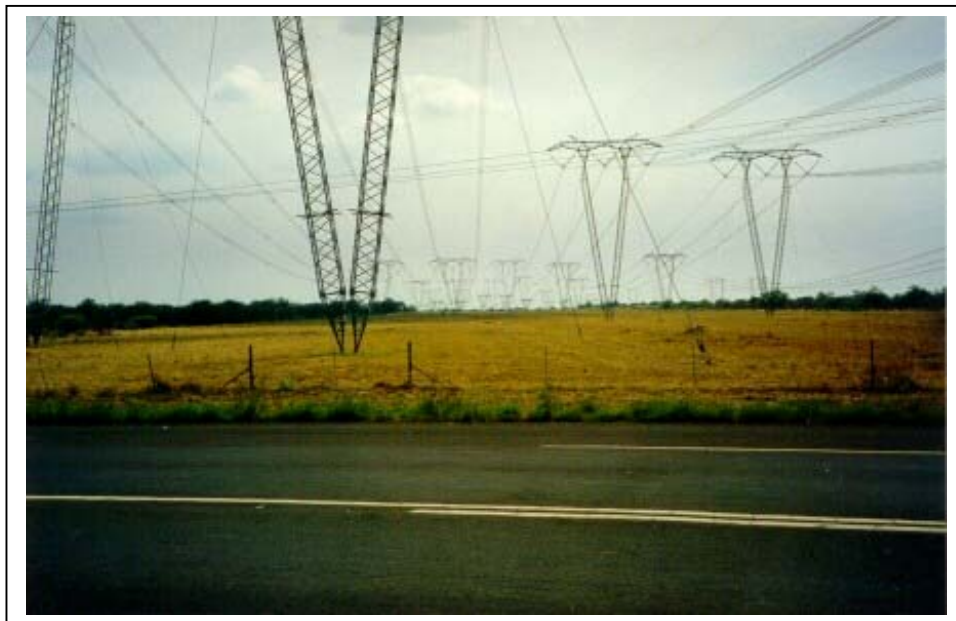
Photograph 8: Existing towers and overhead lines in the vicinity of Matimba Power Station