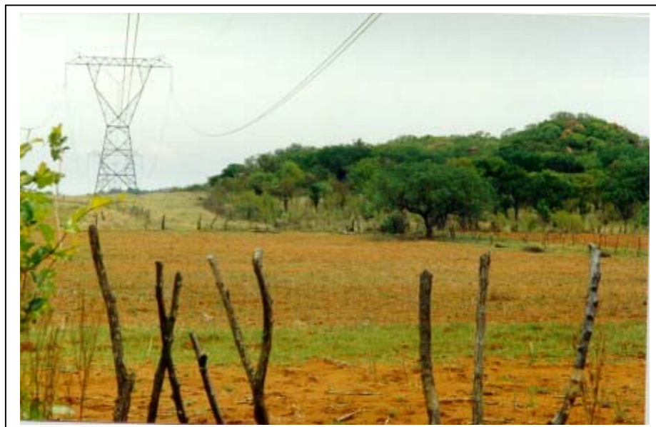
Photograph 4: Change in vegetation and relief, from low bushes and flat topography to trees and higher relief reduces the potential for visual impact from a distance (existing 400 kV Transmission line tower)