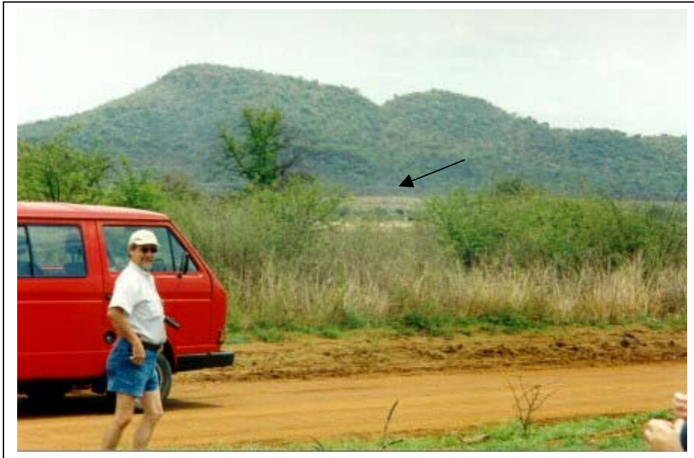
Photograph 5: Mottled backdrop created by the relief and vegetation camouflages towers some distance away from the viewer. The arrow indicates approximate position of a tower of the existing Matimba-Witkop No 1 400 kV Transmission line