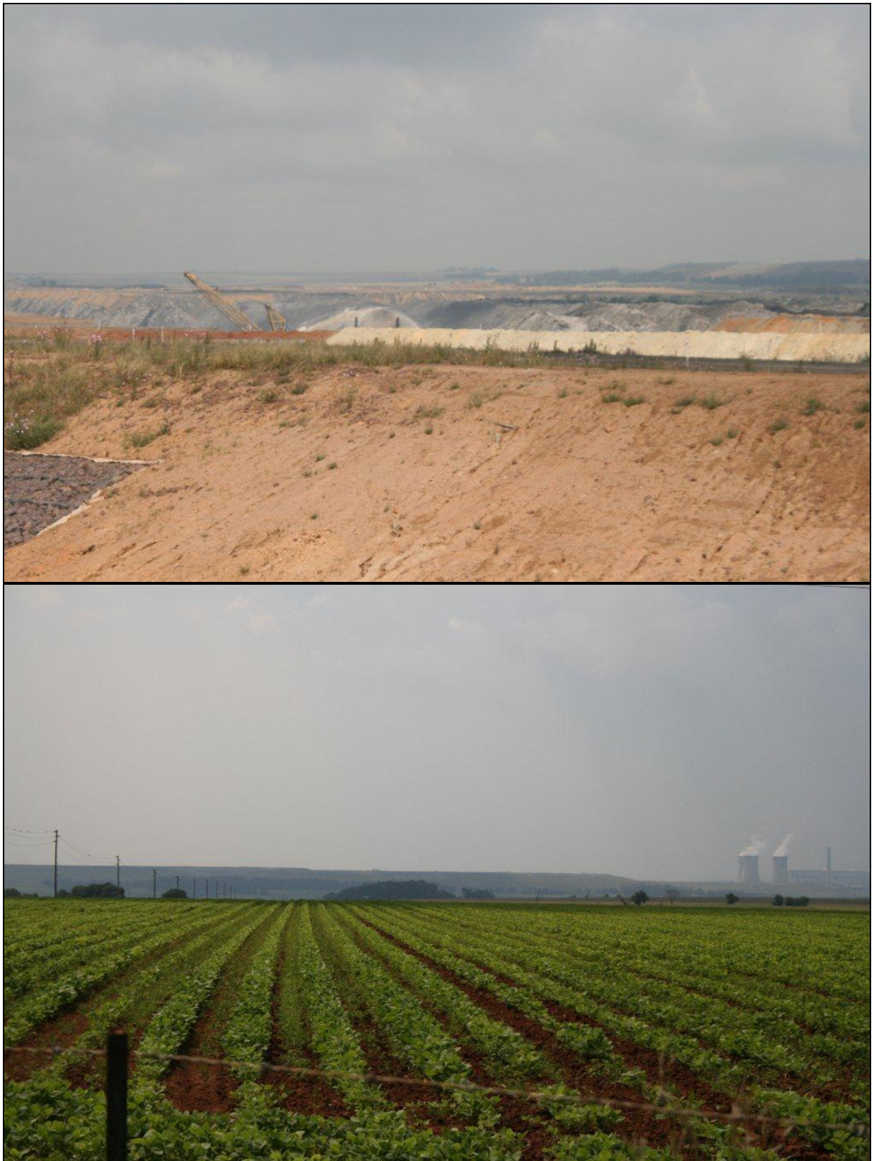
Figure 10.2: The agricultural and mining activities that form the greater part of the study area