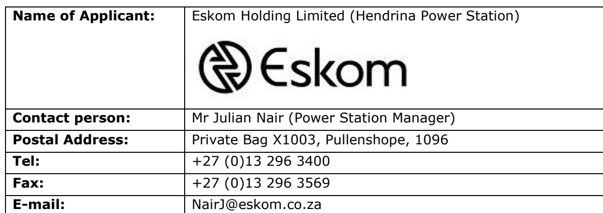
Table 2.1: Details of the applicant

The details of the applicant are shown in Table 2.1 below.