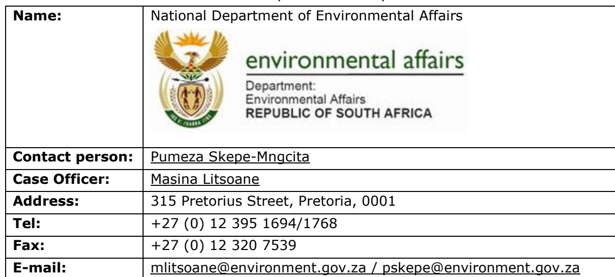
Table 2.3: Details of the relevant competent authority – DEA

The National Department of Environmental Affairs (DEA) will act as the competent authority and the DWA and MDEDET as the commenting authority for this application. The mandate and core business of DEA is underpinned by the Constitution and all other relevant legislation and policies applicable to the government.