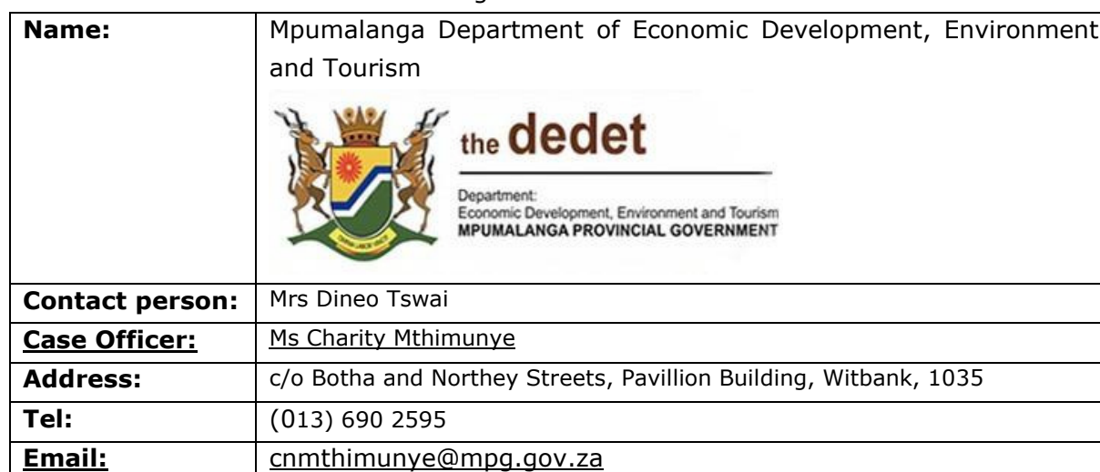
Table 2.5: Details of the commenting authorities – MDEDET

The Mpumalanga Department of Economic Development, Environment and Tourism (MDEDET) and the Department of Water Affairs (DWA) will act as a commenting authority for this application.