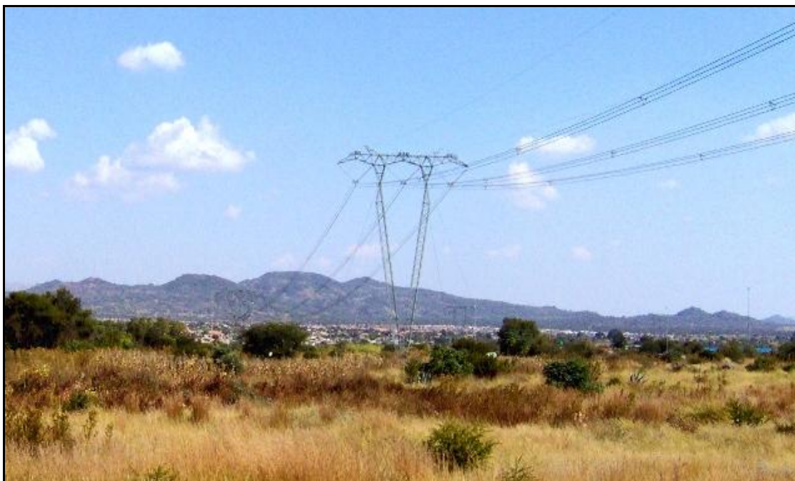
Photograph 2.1: Compact Cross-roped suspension tower typically used along the existing Dinaledi-Anderson 400kV transmission power line route towards Magaliesburg Protected Area

Transmission line conductors are strung on in-line suspension towers and bend (strain) towers. Although the power line structure typology has not yet been decided for this project, typical structures used for the majority of the proposed transmission line are the 400kV compact cross-roped suspension structures (refer to Photograph 2.1). These towers are approximately ~35 m in height and a total footprint area of 55 m is required for each tower, depending on the tower design. These towers are supported by stays or guys in order to stabilise the steel members of the towers.