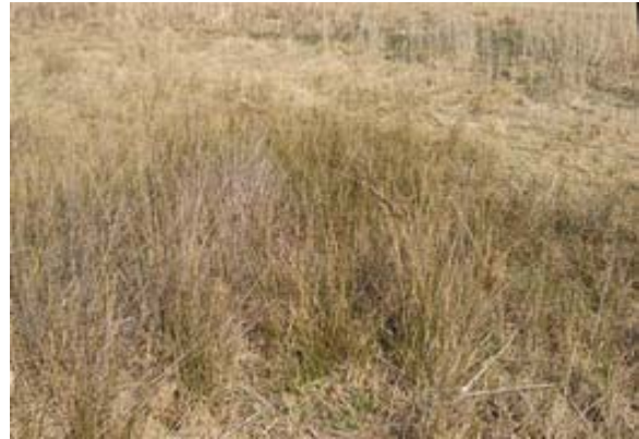
Figure 4. Hydrophyte, Juncus kraussii in wetland