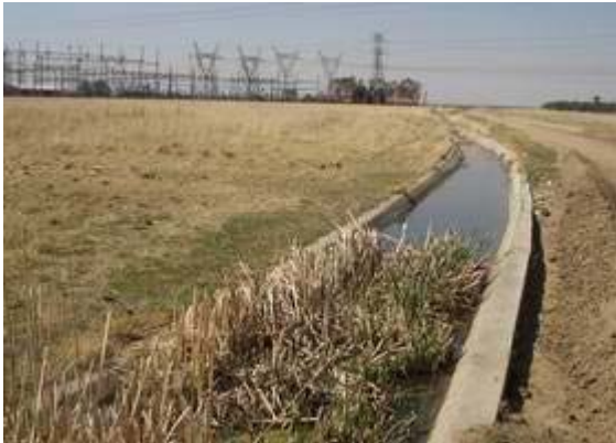
Figure 1. Drainage canal from substation