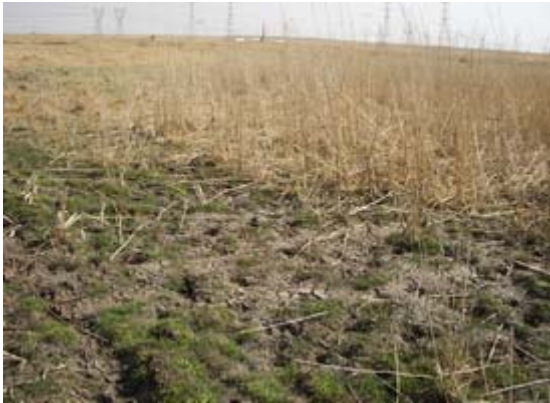
Figure 3. Wetland soils and vegetation.