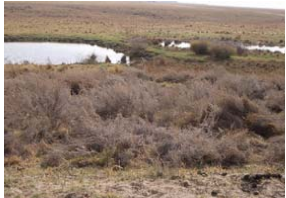
Figure 6. Stoebe vulgaris indicative of temporary hill slope seepage zone. Note abrupt slope down to wetlands around the dam.