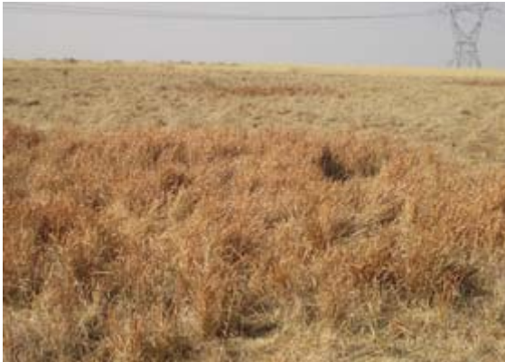
Figure 5. Reddish stands of Ischaemum fasciculatum indicative of seasonally saturated seeps.