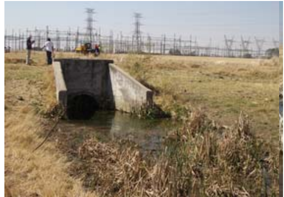
Figure 2. Artificial wetland starts from culvert