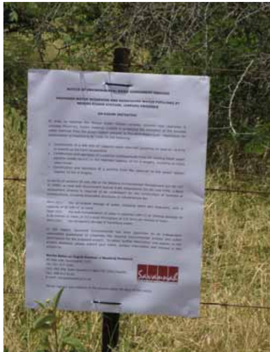
Figure 2: Photographs of Site Advert