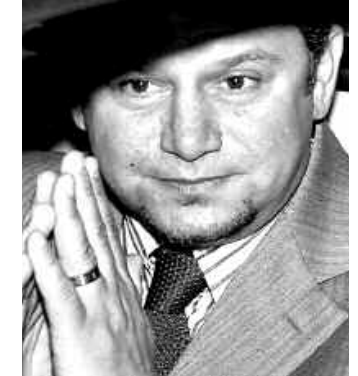
OUT OF POCKET: Fraudster