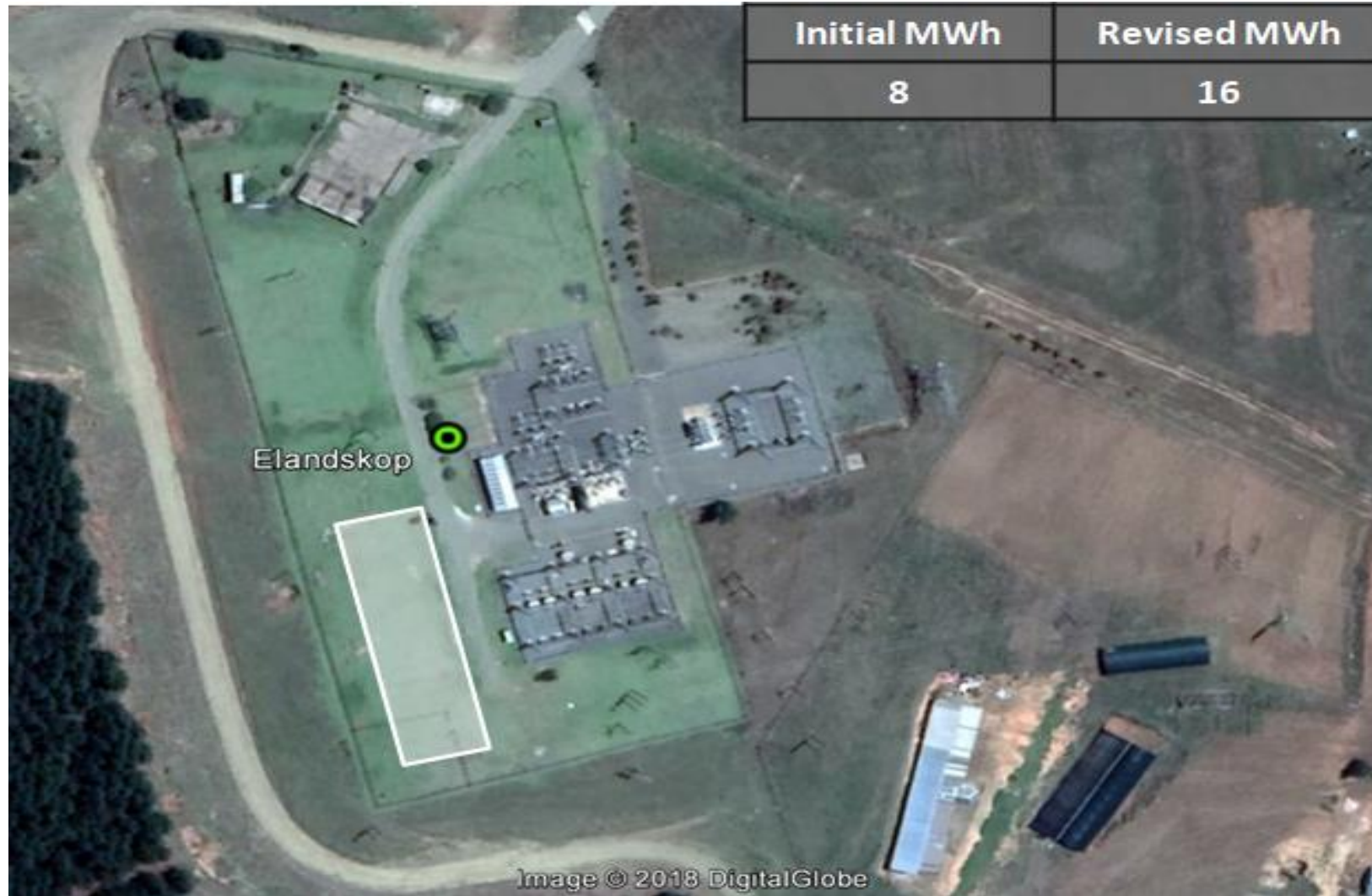
Figure 3: Elandskop Substation and Proposed Area for BESS (white), (Eskom, 2019)