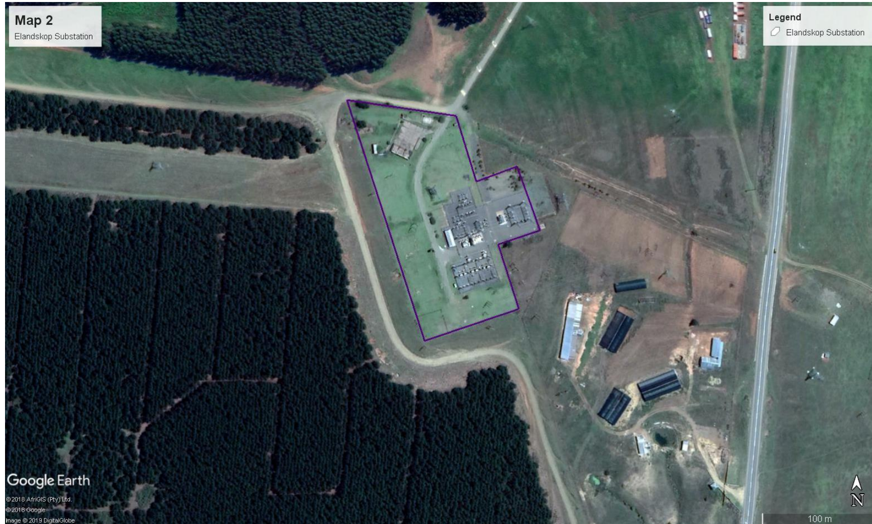
Figure 2: Elandskop Substation (Purple), (Google Earth Imagery, 2018)