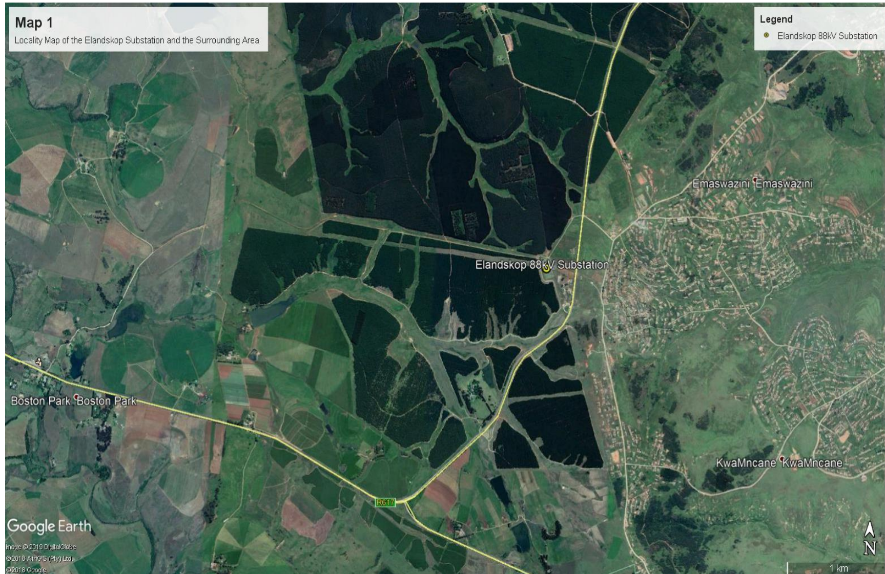
Figure 1: Greater Msunduzi Municipality and Proposed Site Location (Pointed out in Yellow), (Google Earth Imagery, 2018)