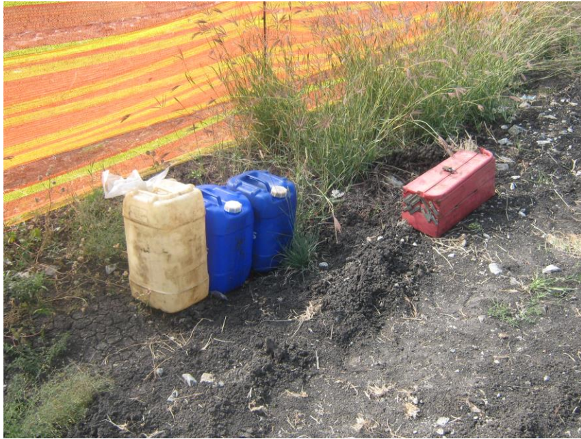
Photo 4: Hydrocarbon containing drums stored directly on ground at the site.