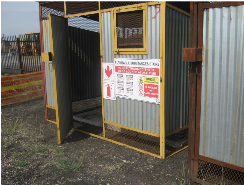
Photo 7: Hazardous material store still has not been rebuilt to have proper bunding.