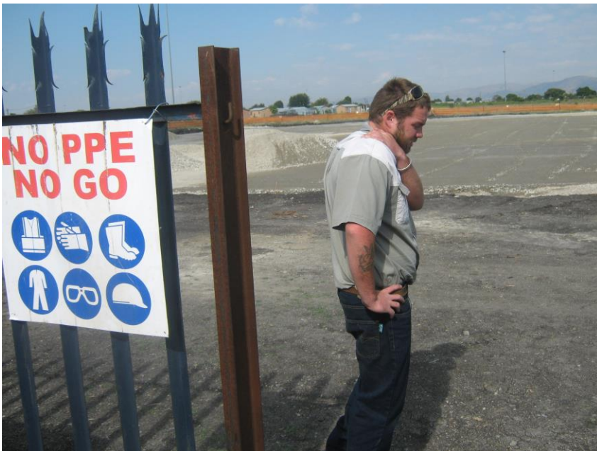
Photo 3: Staff should wear PPE at all times when entering the site.