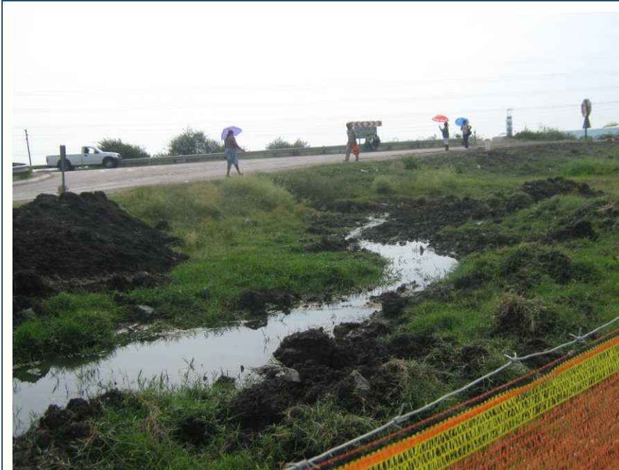
Photo 9: A flow way created by the contractor to encourage standing storm water to flow away from the site.