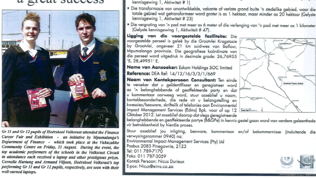
Figure 60: The advert placed in the Kosmos news during the initial call to register (14 September 2012).

Die konstruksie van Gasiliteite of infrastruktuur vir die opwekking van elektrisiteit vaar die elektrisiteit o Die konstruksie van fasiliteite of infrastruktuur vir die opwekking van elektrisiteit waar die elektrisiteit uitset meer is as 10 megawatt maar minder as 20 megawatt, of die uitset 10 megawatt of minder is, maar die totale onwang van die fasiliteit beslaan 'n gebied van meer as 1 hektaar (Gelyste kenningewing 1, Aktiwiteit # 1)