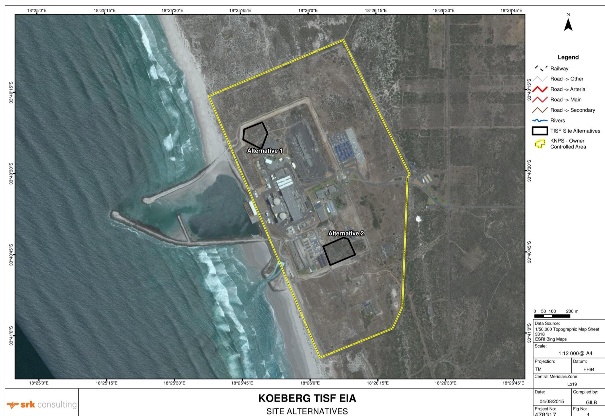
Figure 1: the two viable site locations for the the Koeberg TISF

Location: the proposed TISF will be constructed on vacant land within the KNPS Owner Controlled Area, approximately 30km northwest of Cape Town. Two viable site locations for the TISF have been identified (refer to Figure 1).