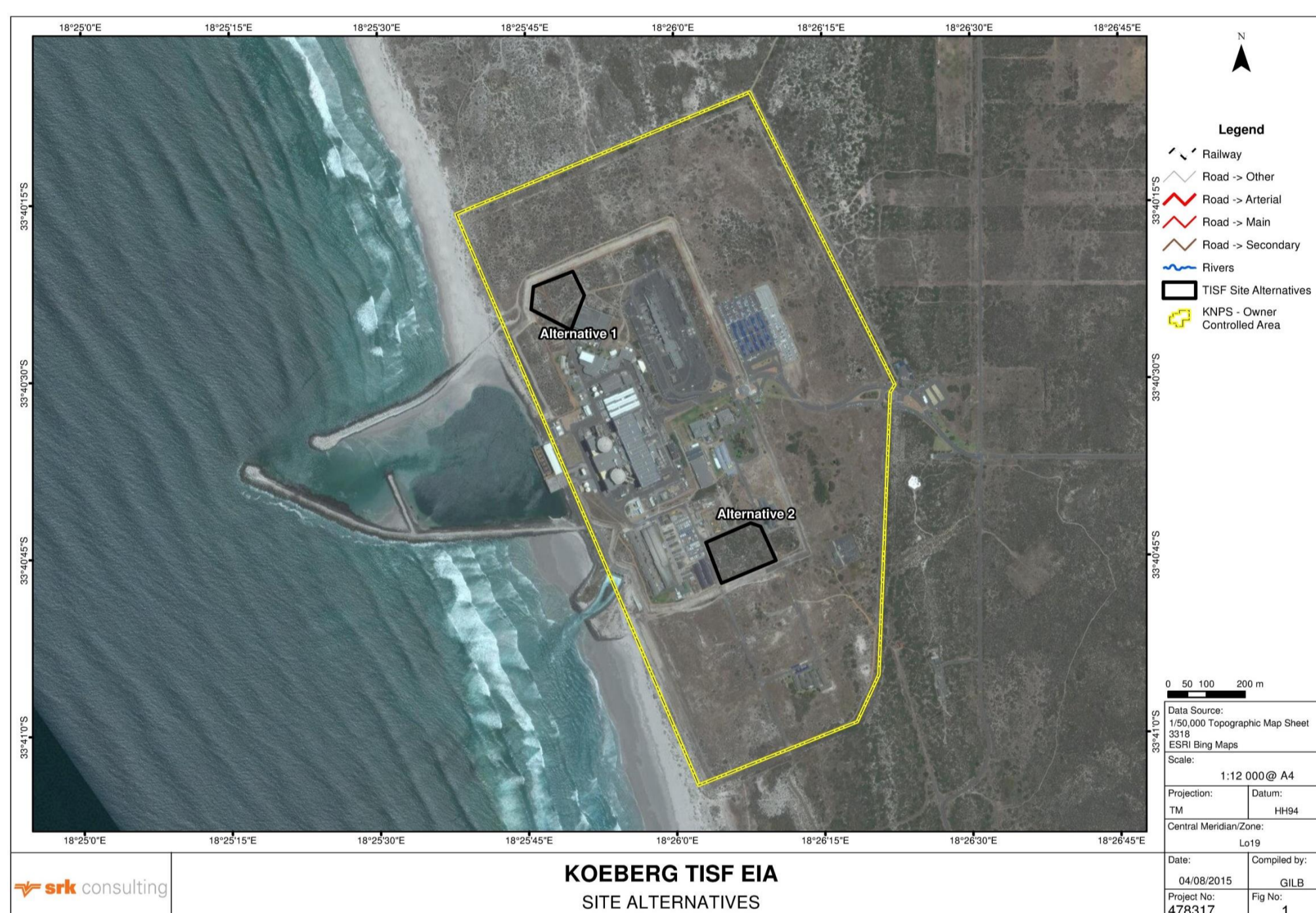
Figuur 1: die twee werkbare liggings van die Koeberg TOBF

Ligging: die voorgestelde TOBF sal op vakante grond binne die KKKS Eienaar Beheerde Gebied gebou word, ongeveer 30km noordwes van Kaapstad. Twee werkbare liggings vir die TOBF was geïdentifiseer (veryws na Figuur 1).