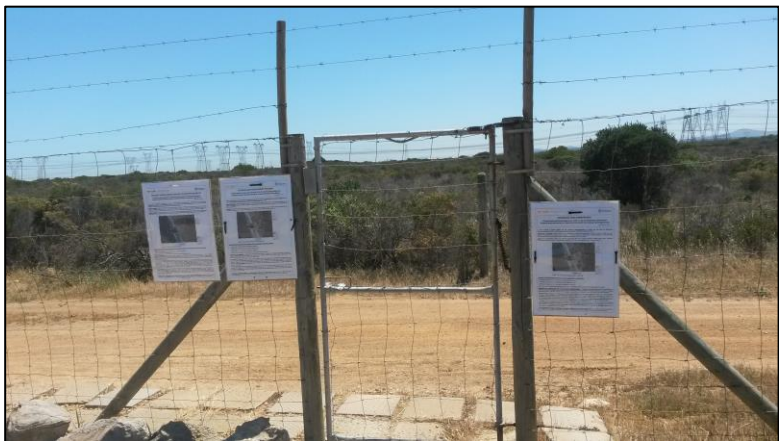
Placement of Site Notices at R27 Entrance to KNPS