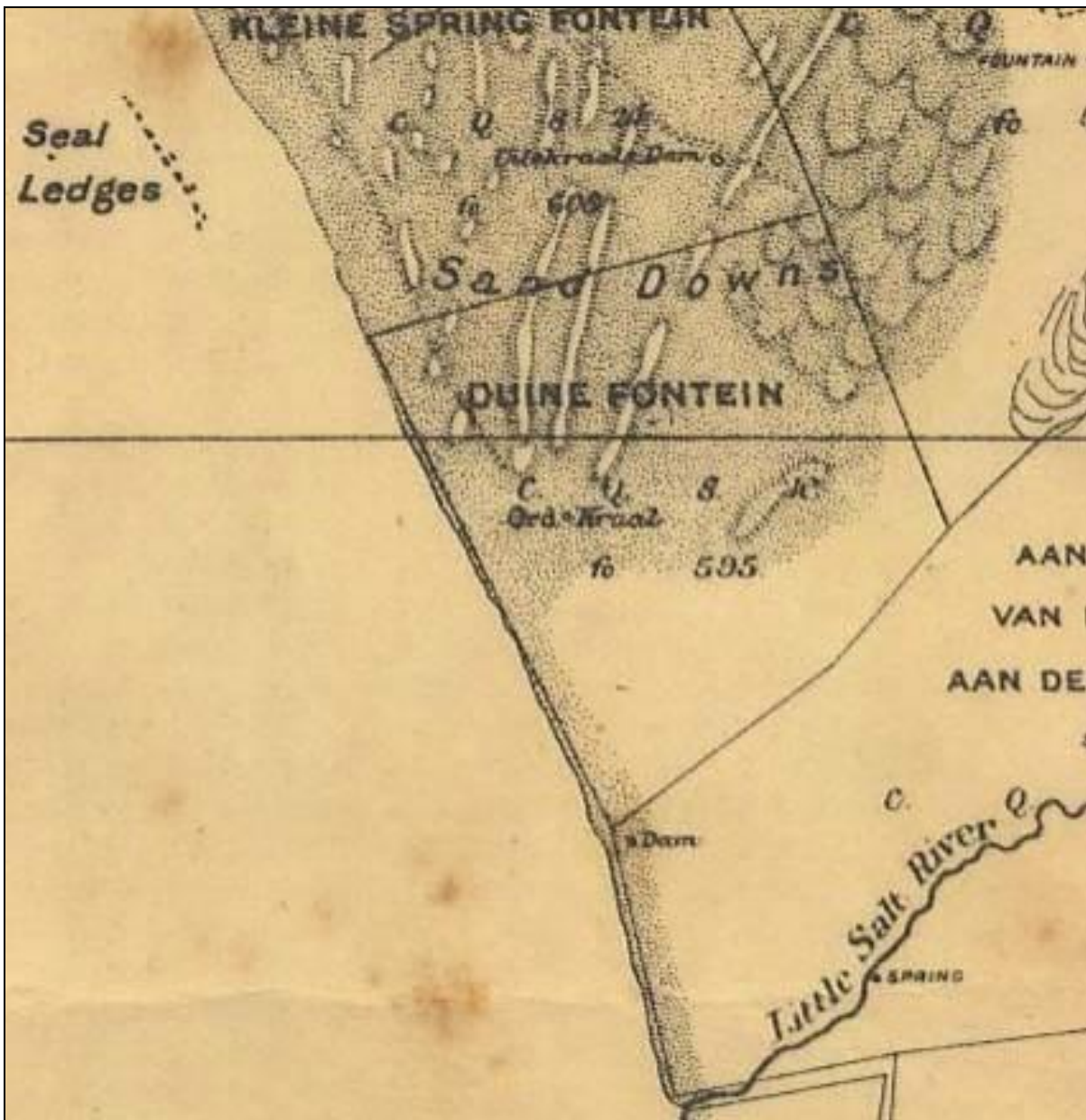
Figure 5. Detail from SW Cape Survey Map c.1890

The colonial period history of Duynfontein is interesting, however it does not reveal any particular significance in terms of associations with events, or important historical personalities. The early surveyor's diagrams have been superimposed over modern plans of the farm in an effort to locate the historic kraal. The kraal location appears to be outside of the study area. The site of Demper's house is not known, nor any of his tenants. It is possible that ephemeral evidence of its presence may lie under the dune sands somewhere on in the area.