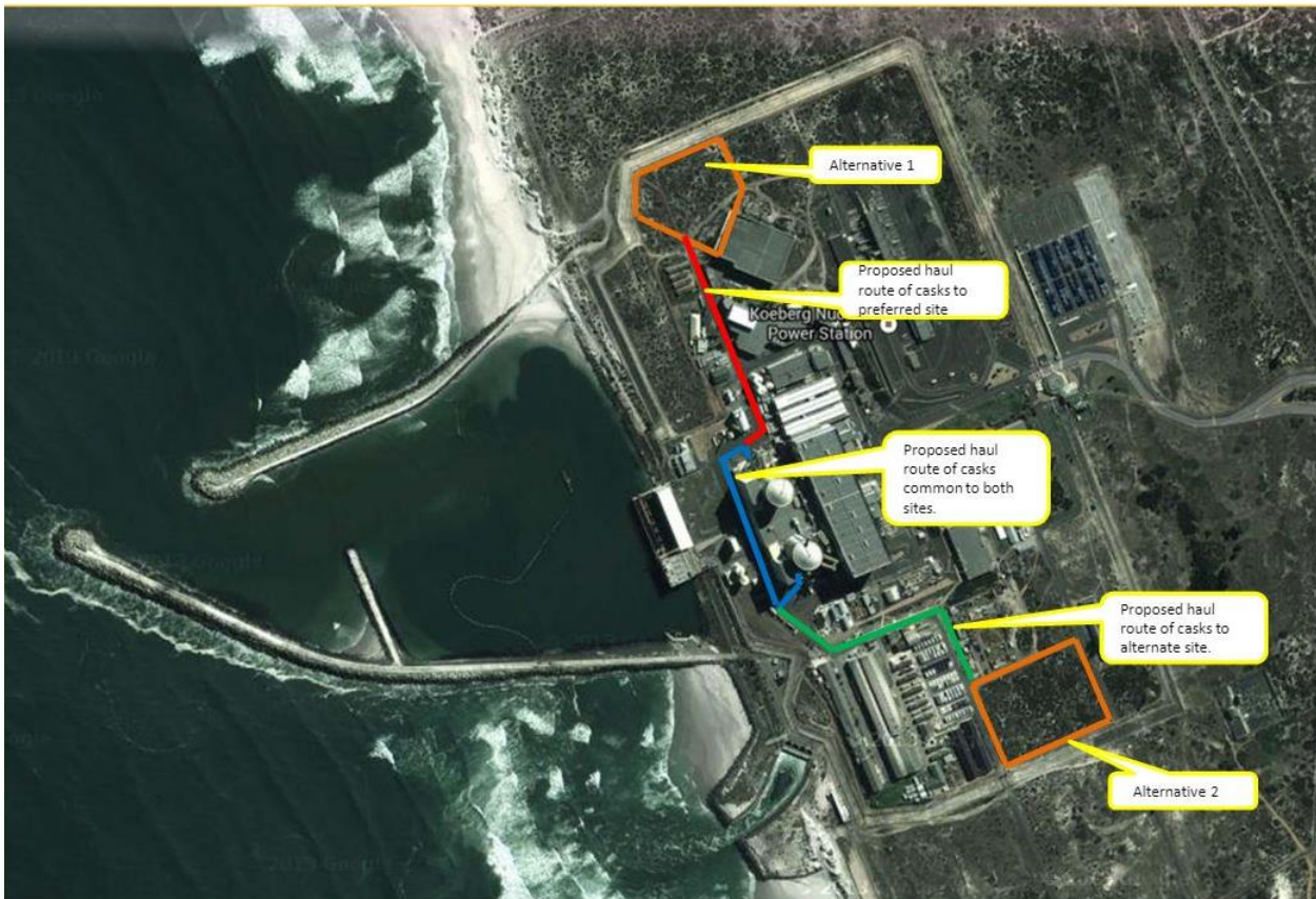
Figure 1. The haul road and two alternative sites for the TISF

Two alternatives for the TISF have been proposed (Figure 2). Alternative 1 is the CSB Site immediately to the north of the reactors and Alternative 2 is the Ekhaya Site, immediately to the south of the reactors. Alternative 1 is the preferred site. Only one alternative has been proposed for the haul road, however different parts of this road will be used, depending on which TISF site alternative is selected.