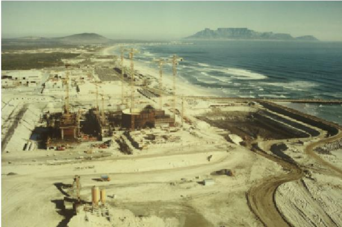
Figure 2. Koeberg Nuclear Power Station during construction in the 1970's. Note the extent of transformed landscape to the north and south of the power station site which includes the proposed sites for the TISF. The damage has since been rehabilitated (photograph courtesy of Gert Greeff).