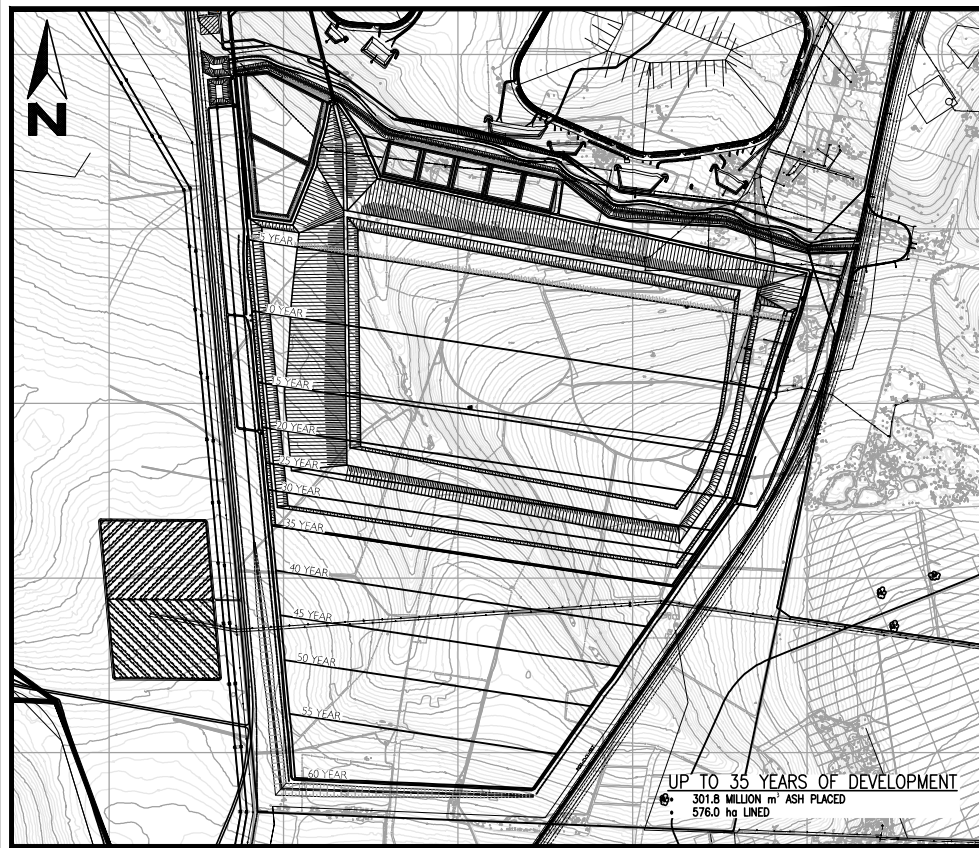
35 YEAR PLAN 1:15 000