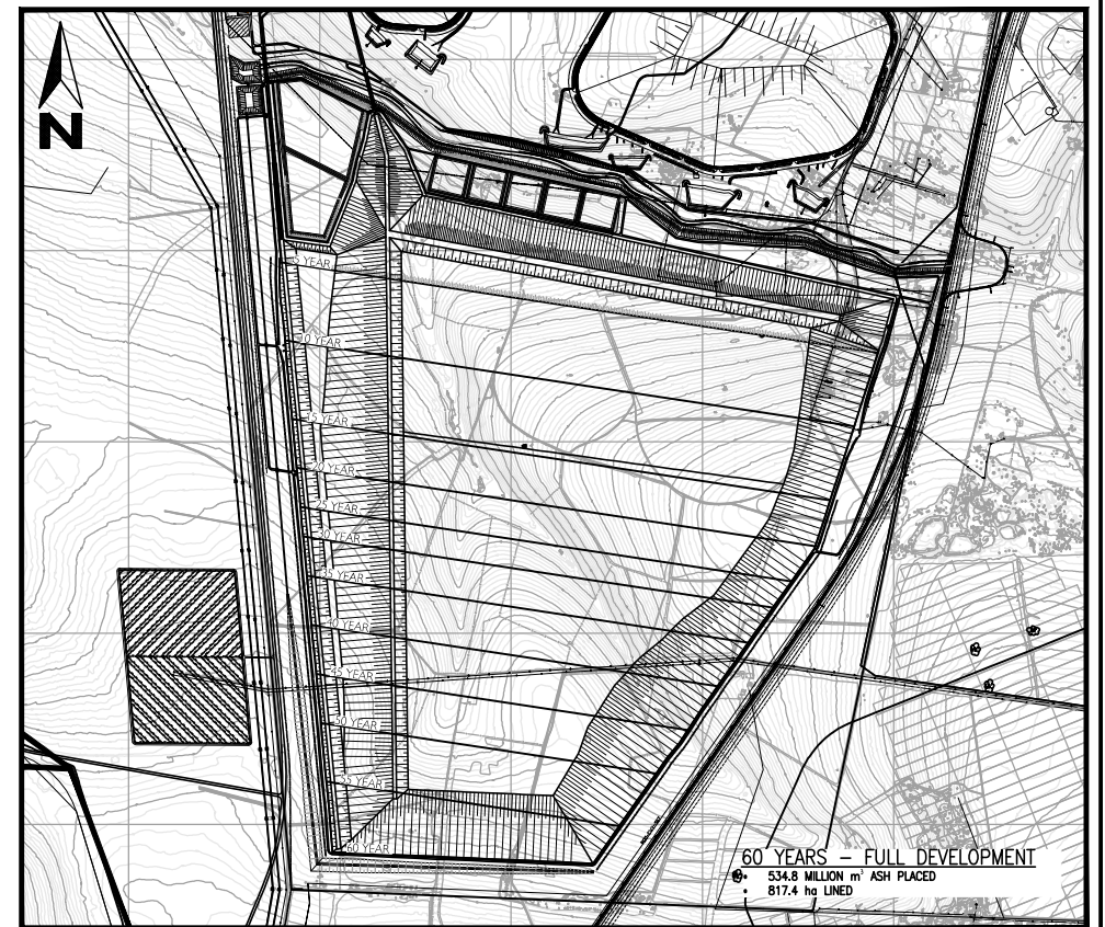
60 YEAR PLAN 1:15 000