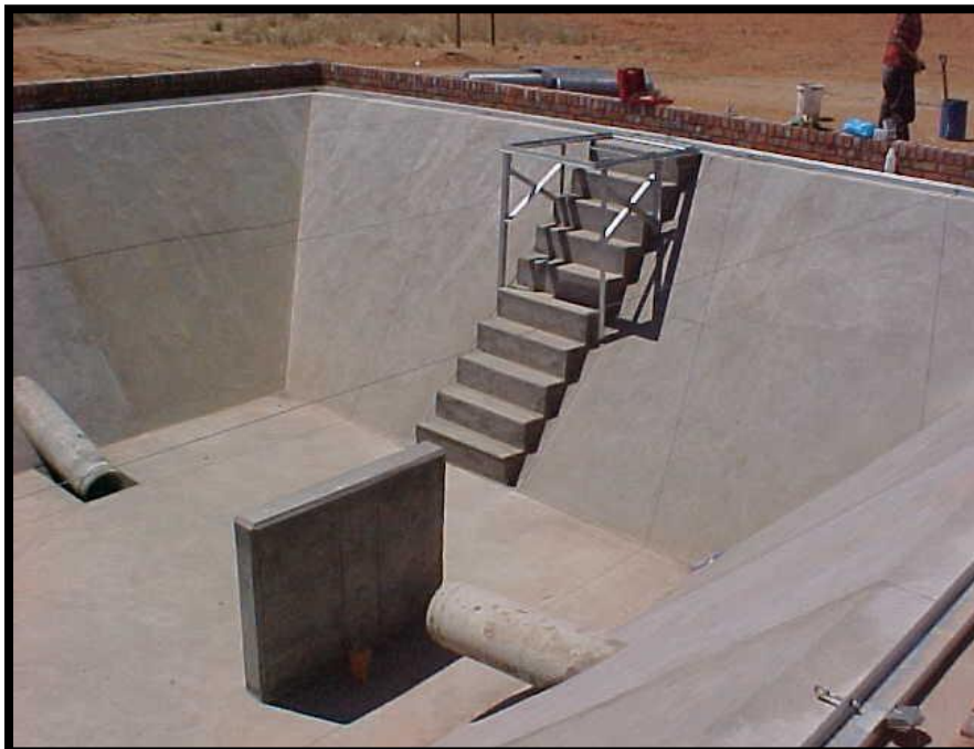
Figure 4: Construction of an oil holding dam