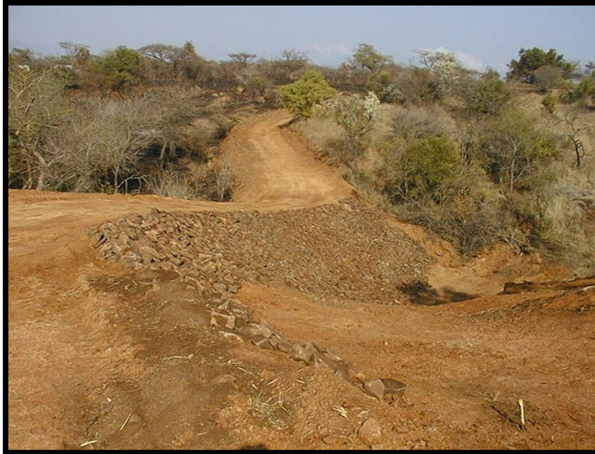
Figure 1: A typical special access road