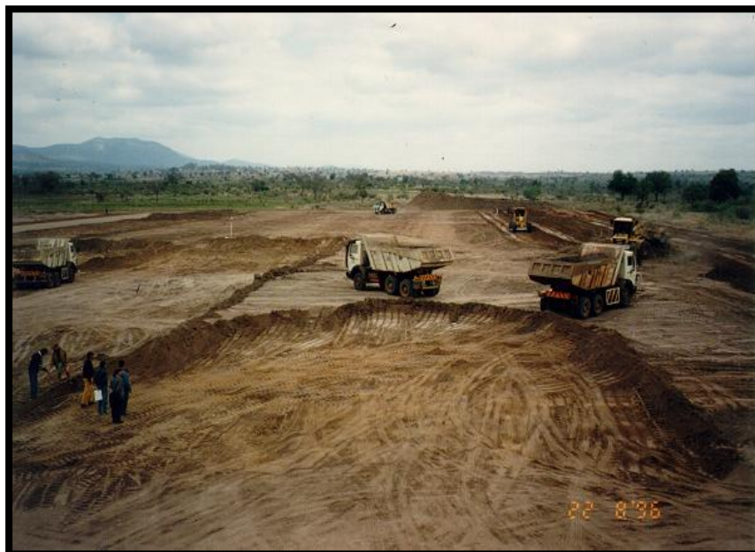
Figure 2: Typical substation terrace and levelling