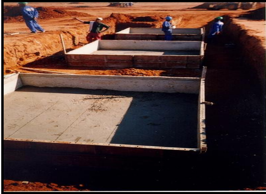
Figure 3: Construction of transformer foundations