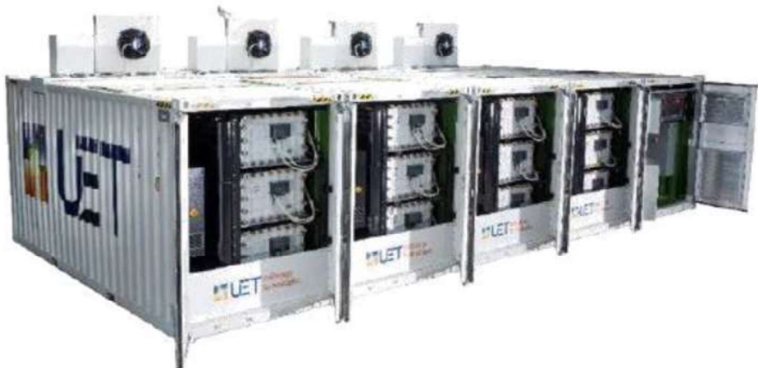
Figure 2: Flow Battery - Vanadium Redox Battery

Vanadium Redox (52500 litres per 1 MWh) and Zinc Bromide (1700 litres per pod; 13.6 Cubic Meters per 1MWh).