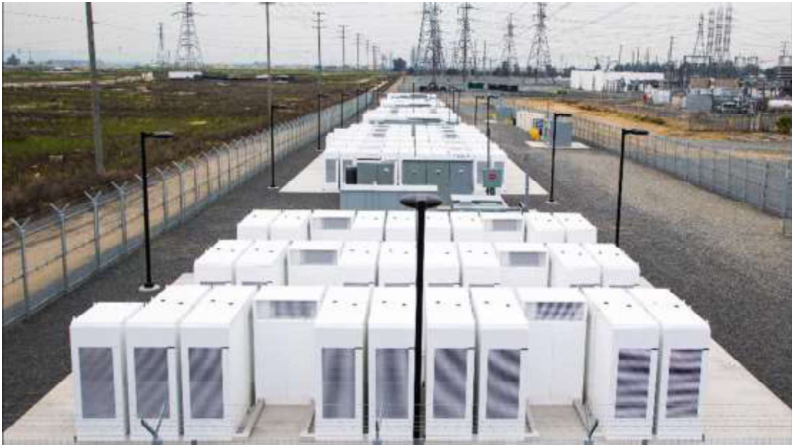
Figure 1: Lithium-ion Power Pack Units

Lithium-ion, approximately 4.08 Cubic Meters per 1MWh (Exact amount of hazardous substance is unknown at this stage and will differ from supplier to supplier).