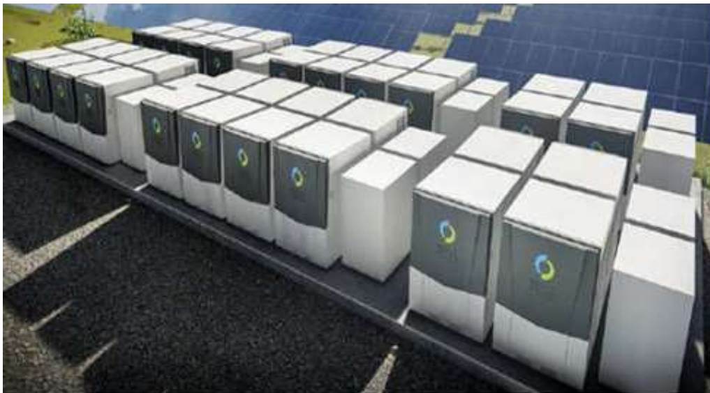
Figure 3: Flow Battery - Zinc Bromide

A single battery technology, or a combination of two or more technology alternatives, may be implemented at each site. The chemical composition of the batteries can be dangerous and hazardous and listed in SANS10234.