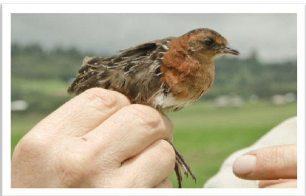
Critically endangered: Wattled Crane and White-winged Flufftail