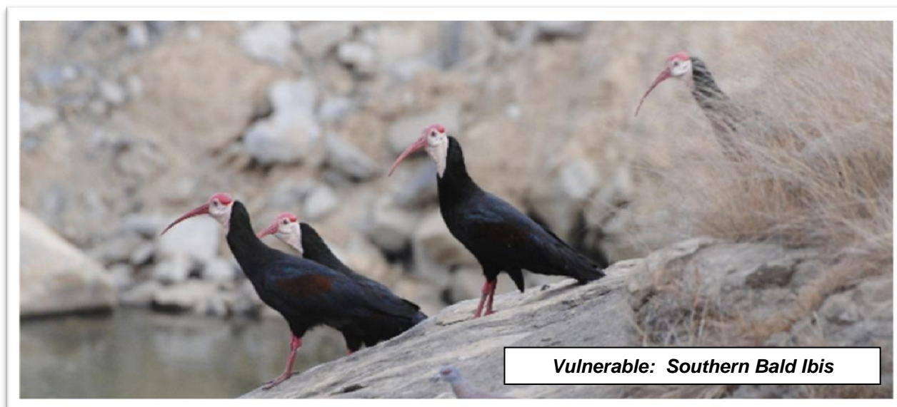
Vulnerable: Southern Bald Ibis